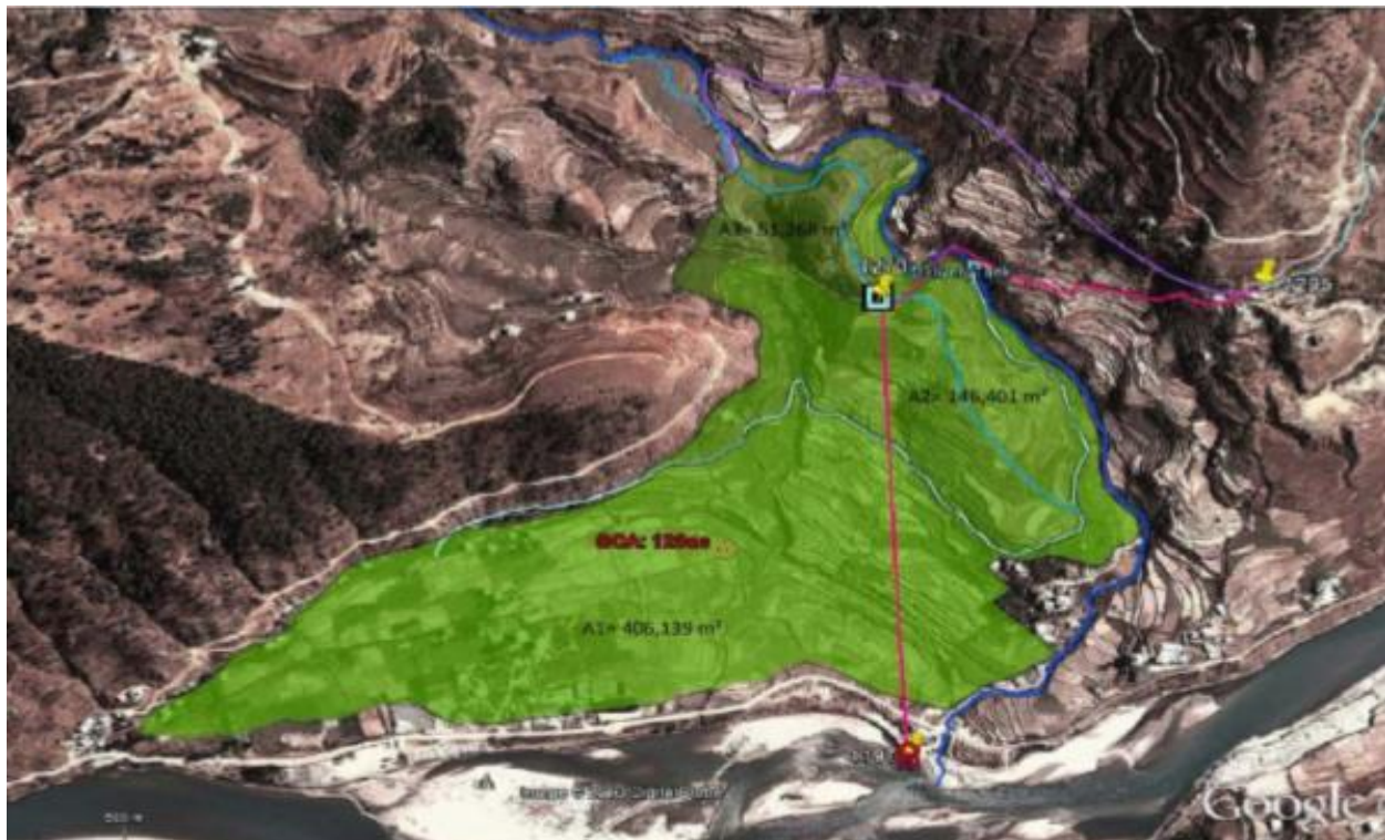
Image 6: Graphical Representation of the Siphon Pipeline

Planning for the project started in February 2014 with the surveying, designing, and cost estimation being carried out by the implementing agencies. A Memorandum of Understanding (MoU) was signed between the collaborating partners on 6 March 2014. Until mid-March 2014, quotation calls for civil works was done, and the contract was awarded to a local contractor. From March onwards the new pipeline was laid, and concrete work was carried out. Over the course of 6 months, the project was carried out and was finally handed to the communities of 31 households of Wangjokha and Thanggo villages under Thedtso gewog (Block) on 14 September 2014.