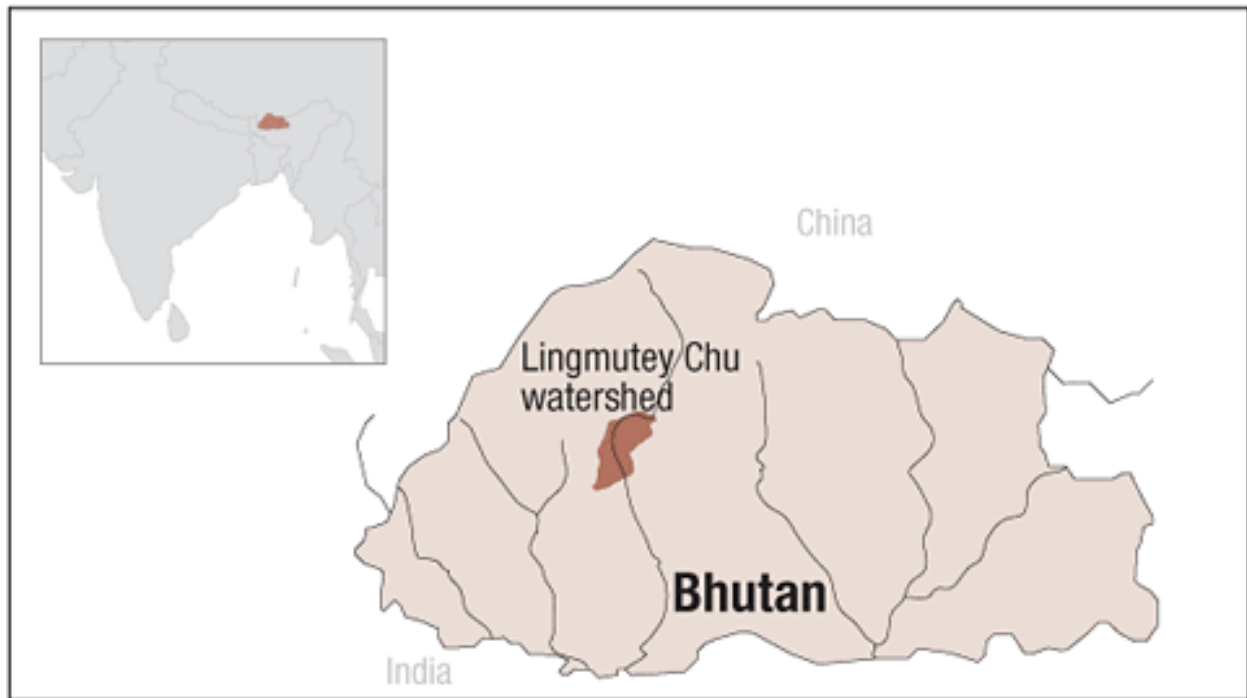
Image 1: Lingmutey-chu Watershed (International Development Research Centre)

the region. Bhujel states that Lingmutey-chu is a seasonal stream that depends on rainwater and is the only source of water at 2500 meters above sea level, which feeds 16 irrigation canals in the watershed. Under normal circumstances, the stream does not have sufficient flow to irrigate the whole agriculture land within its catchment. Local farmers experience severe water shortage during the dry season for paddy cultivation. The demand for water in the area has increased over time while the sources have been in decline. This miss-match leads to water crises in the area.