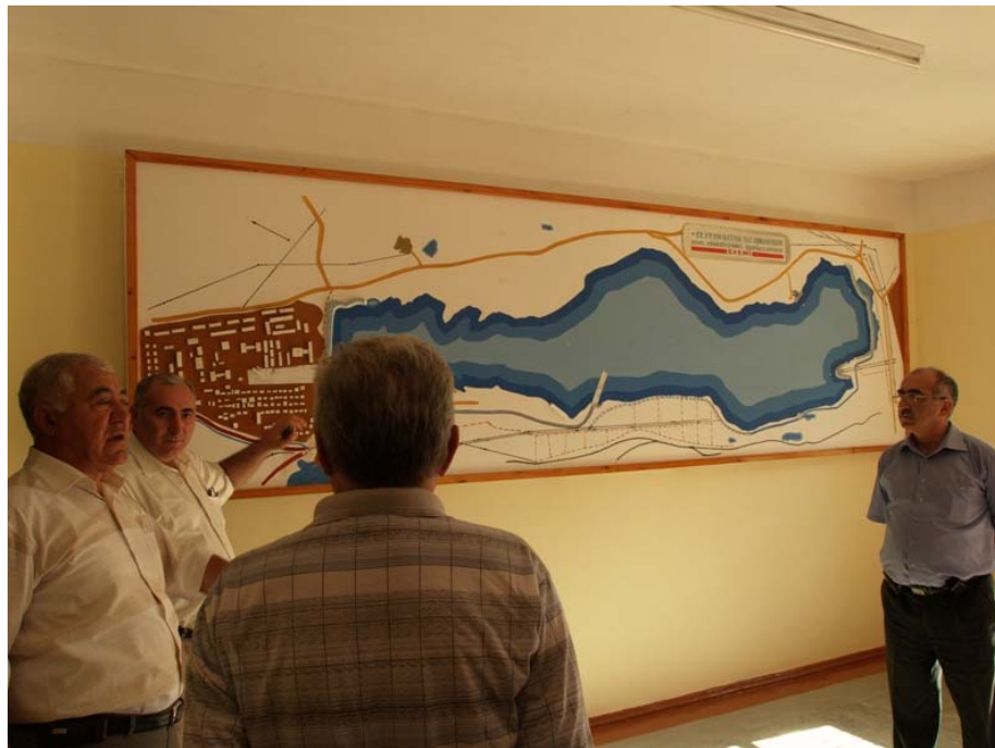
Picture 5.1. Azeri colleagues explain to GWP CACENA delegation their plans of reconstruction and development of the water supply system in the areas surrounding Baki at the expense of the state budget of Azerbaijan (2008)

Distribution of the WSS regulation functions among various ministries and state authorities that have different priorities does not facilitate achievement of the required level of functioning, operation and the overall and equal development of WSS systems. Institutional structures for regulation, management and development in many countries of the region still need reforms depending on the national policies and strategies in each of the regional states.