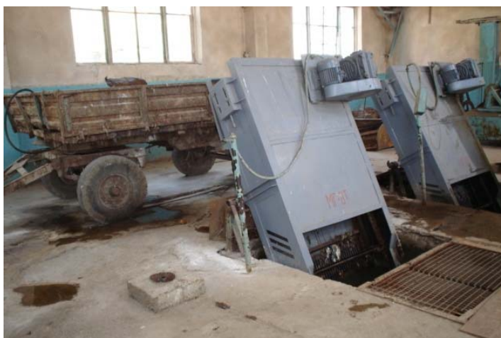
Picture 3.3. Debris filter of the treatment facilities in Fergana, Uzbekistan