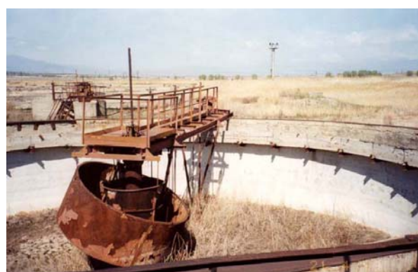
Picture. 3.4. Actual state of some of the treatment plants in the Southern Caucasian countries