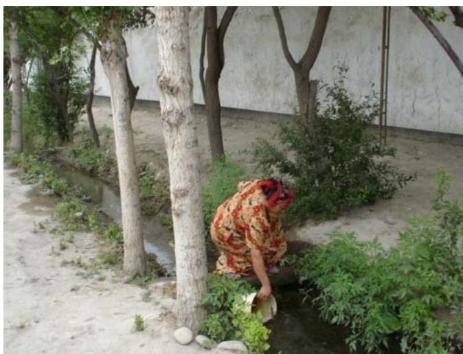
Picture 3.1. Over 40% of rural population in Fergana Valley use untreated water for household needs out of the wells and aryks (open ditches).

In Uzbekistan there are 265 cities, towns and settlements, 11.844 villages, including 903 in the hardly accessible small villages. In certain provinces of the country (Bukhara, Khorezm, Karakalpakstan) coverage of population with water supply systems is only 20-25 %. Water ducts and water supplying pipelines in the cities and settlements of the country are made out of the steel pipes. During the last 20-25 years of their operation, their wear-and-tear rate has reached 50%. Water pipelines are not being to their full capacity, thus water losses reach the rate of 40%. The oldest and the most developed system in Uzbekistan is the potable water supply system of the city of Tashkent. Water supply of Tashkent is being effectuated out of two sources: surface and underground located in the basin of Chirchik River.