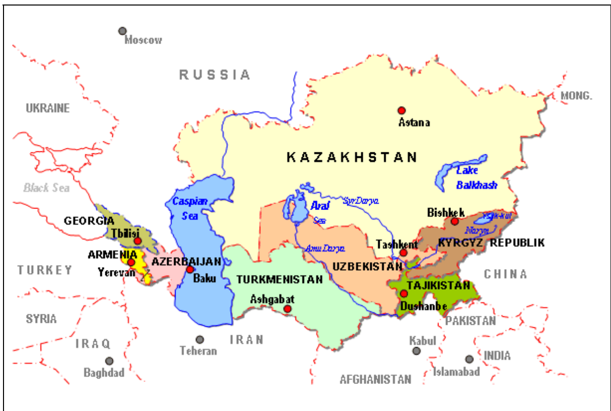
Picture 1.1. Geographical location

The Central Asian states (Kazakhstan, Kyrgyzstan, Tajikistan, Turkmenistan and Uzbekistan) are located in the center of the Eurasian Continent. Neighbors of those countries are Russia, China, Iran and Afghanistan. Western borders of Kazakhstan and Turkmenistan are being washed by the Caspian Sea. South-East borders of those countries stretch over the Tien Shan and Pamir Mountains. Republics of the Southern Caucasus (Azerbaijan, Armenia, and Georgia) are typical mountainous countries with a specific complex mountain terrain, which are situated to the south of the Caucasus Range between the Black Sea and the Caspian Sea. Southern borders of those states (Armenia, Azerbaijan) are being defined by Araks River. Countries of the Southern Caucasus have borders with Russia, Turkey and Iran (Figure 1.1).