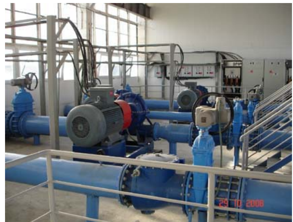
Picture 3.2. The Ararat Pump Station: prior and after reconstruction

In Georgia the coverage of centralized sewage system on average ranges from 28,7% in small settlements to 93,2% in major cities. However, in some urban settlements there is no centralized sewage system. Sewage systems are available in 45 cities of Georgia, but the state of those systems is very poor. STPs have been built in 33 cities. Those plants were put into operation during the period of 1972-1986. At present, none of the biological treatment steps of the plants is functioning. Mechanical treatment of sewage is being operated to some extent only in the STPs of Tbilisi and Rustavi, however the major part of the facilities is virtually out of operation. In settlements, where there are no treatment plants, sewage discharge directly into the natural surface water bodies. In recent years one sewage treatment plant with complete biological treatment has been built in the city of Sakhchere.