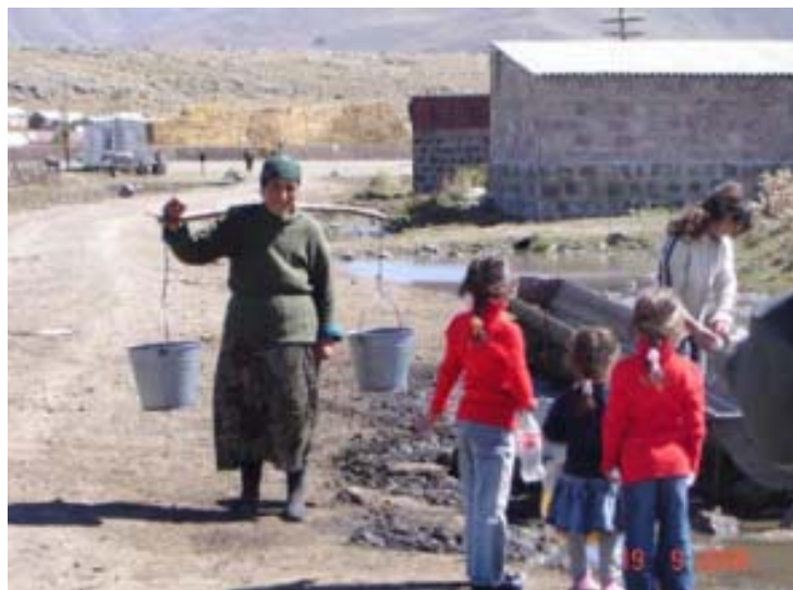
Picture 6.2. Rural water supply in Aparan District of Armenia