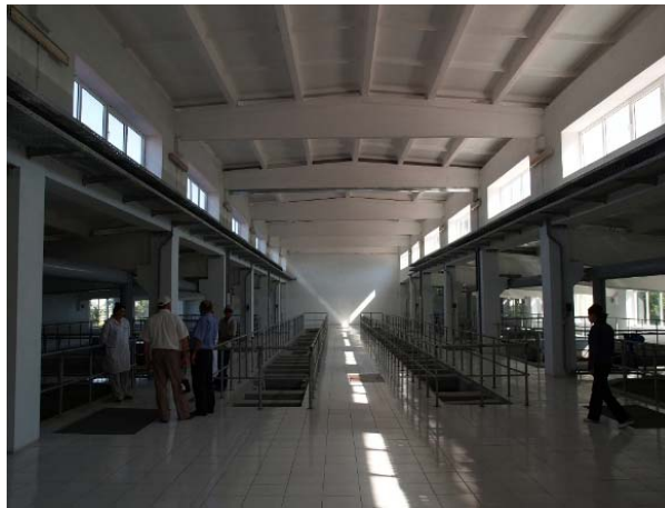
Picture 3.1. Newly constructed chlorination plant for drinking water in Azerbaijan

In Soviet period about 20 sewage treatment plants used to operate in Armenia, they used to cover the capital city of Yerevan, 25 other cities and towns and 55 rural settlements. Out of the number of existing STPs at present only the Yerevan Aeration Plant is operating, effectuating only mechanical treatment of some portion of the sewage. Starting from 2004 decisive steps have been taken in order to rehabilitate the sanitation and sewage treatment plants of Armenia.