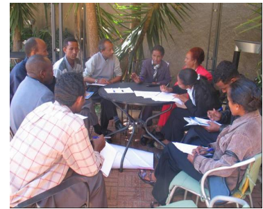
Participants share experiences at a Gender Mainstreaming Workshop

Implementing IWRM Action Plan requires a significant amount of financial resources both from internal and external sources and this is expected to be one main challenge to continue and implement the IWRM process. As the project came to a close, a financing round table had not been developed but this will be increasingly necessary to get solid commitments from the variety of implementing agencies and development partners.