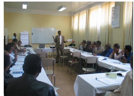
Participants at a capacity building session organized by the CWP.