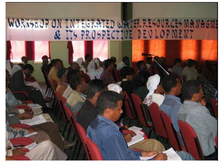
A Stakeholder awareness meeting in Zoba Maekel Region, Eritrea