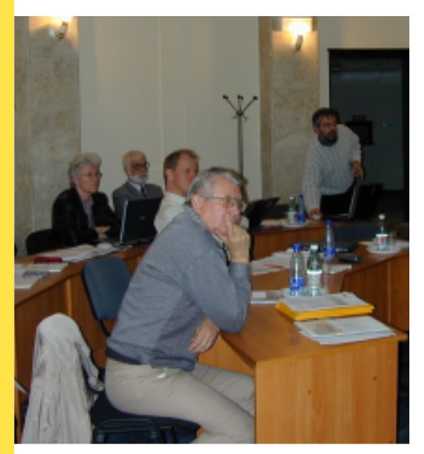
Time for the reflexion: building a groundwater model on the border with Russia to better share water resources

hydrological parameters, transmissivity, and permeability). At that stage, the model of the geological structure has been finalized for Estonia as well as the piezometry of all aquifers, the permeability map and withdrawal maps, and different files for visualizing the results.