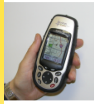
GPS are widely used to locate objects in nature

A total of 103 lakes were assessed, i.e. almost all lakes with a surface exceeding 10 hectares, and few other ones presenting particular ecological or recreational significance. Assessment used mainly existing limnological database, and additional observations were carried out on eight lakes. Among the lakes assessed, 9% belong to high quality class, 48% to good, 39% to moderate and 4% only can be characterized by poor quality. Long-term monitoring data allowed experts of Life, Tacis and UNDP/GEF projects to conclude, during a bilateral Russian Estonian seminar, that the status of the lake Peipsi can be considered