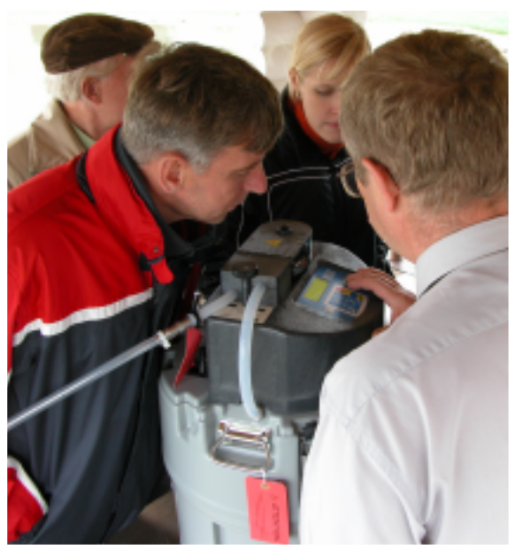
Training has been a key element of the project; here in Tartu, the practice follows the theory.

The project booklet Assessment of the State of Surface Water Bodies and Groundwater has been issued at the fall of June 2004; its presentation took place at the Ministry of the Environment on 7th of July 2004. The print run of one thousand two hundred largely allowed distributing it.