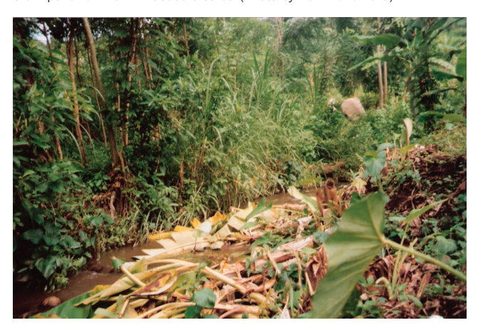
FIGURE 2 Encroachment: banana, yams, and eucalyptus trees planted along the Mpondwe River in Kasese district.

Nyamwamba River in Kasese, the Mugwanjura Gravity Flow Scheme in Ntungamo, and the Rwizi River in Mbarara were found to be experiencing drastic water reduction. This water crisis is further aggravated by environmental degradation in the form of high soil erosion rates, and the reported decrease of the water table leading to nonfunctionality of public water works, as well as a change in local climatic conditions. For example, Mzee Karoli Kanyinondi (72) of Mbarara explained during an interview that the dry season—which used to occur in July–October in Ankole—can no longer be predicted and now occurs at any time. As a result, all districts visited reported seasonal shortages of food due to crop failures and unpredictable rains.