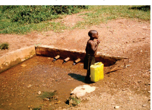
FIGURE 3 Poor maintenance: the immediate surroundings of this protected spring are not maintained. This affects both water quality and yield.